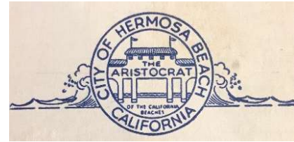
Other logos/variations in use by the City and/or community