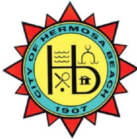
Current City Seal (1964 Present)