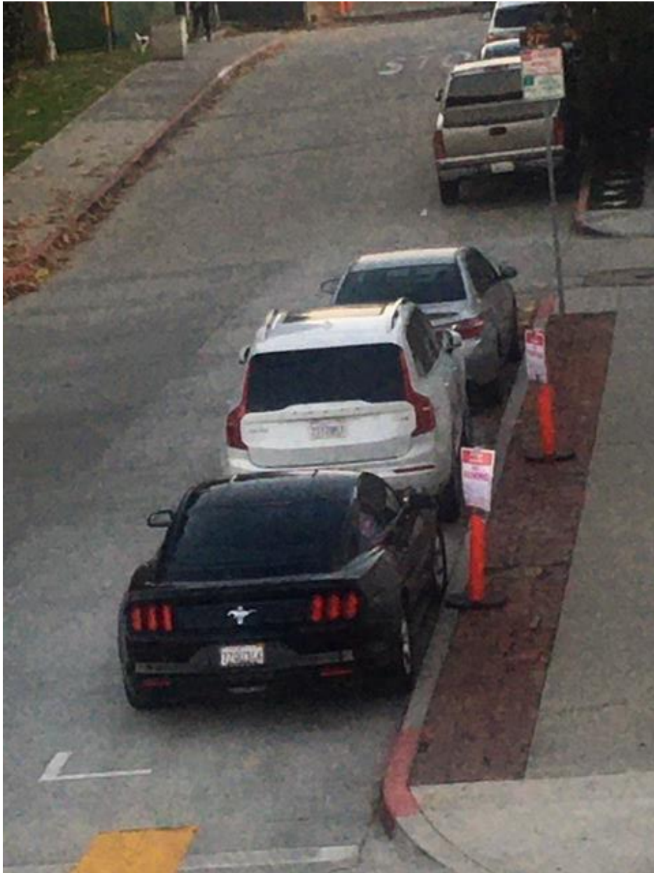
Immediately to the west on 27th street parking cones restrict 4 spaces for a residential construction project.