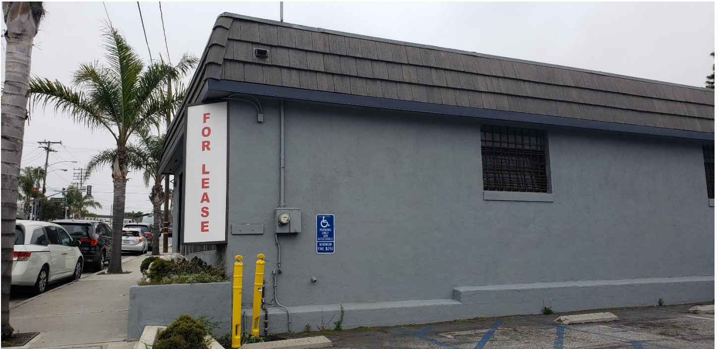
West Building Elevations