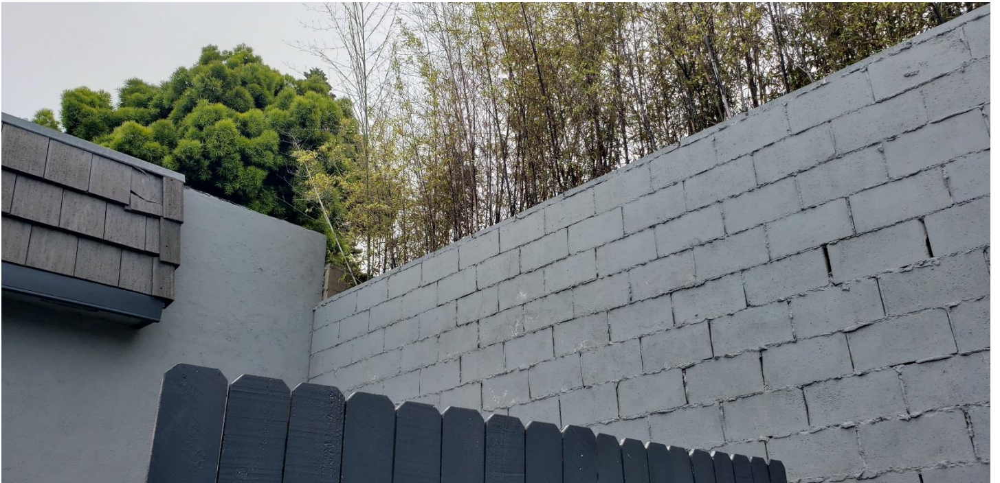
Wall abutting residential uses to the south