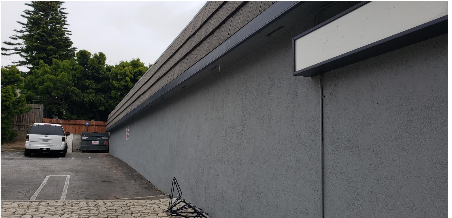
East Building Elevation