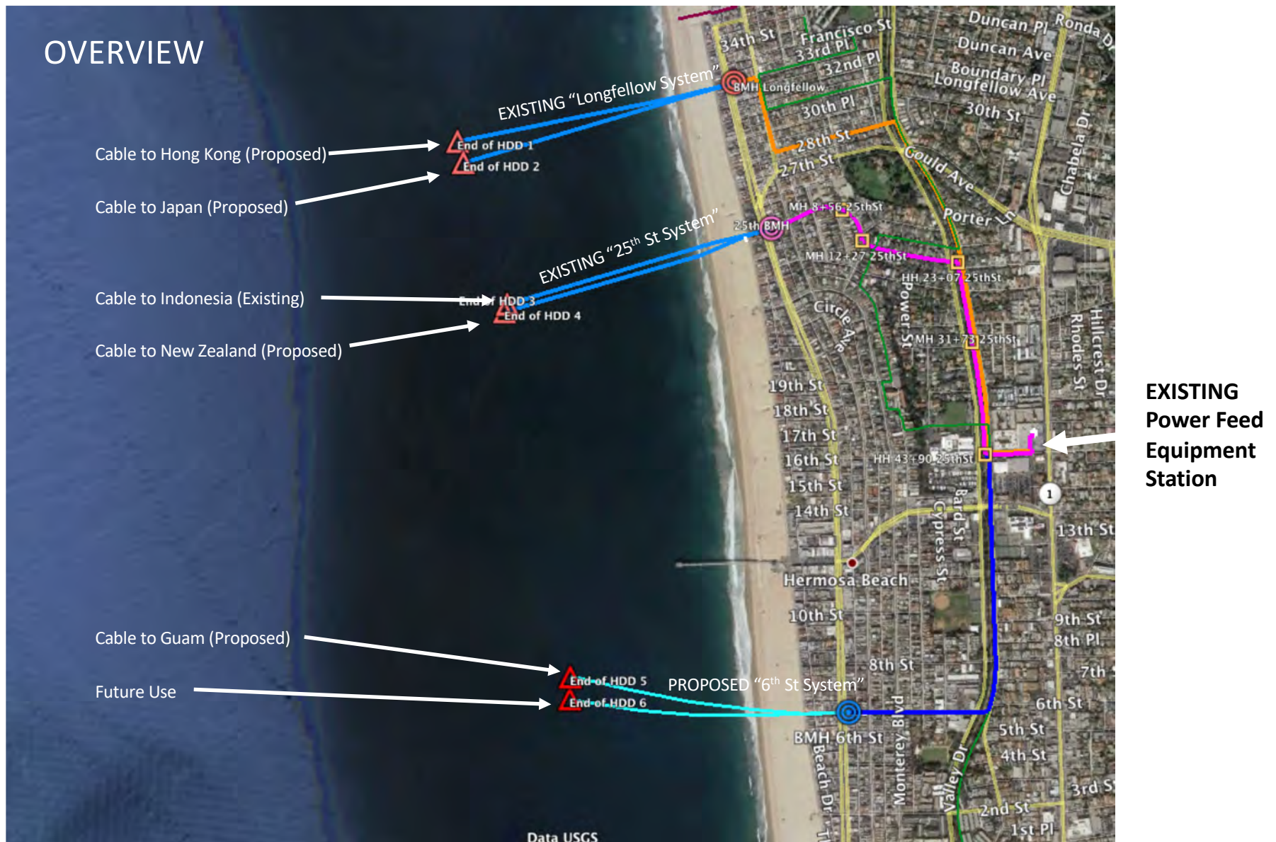
Figure 1 – Overview RTI Infrastructure Facilities – Hermosa Beach, California (Existing and Proposed)