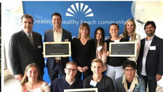
Student Stress & Substance Use Summit