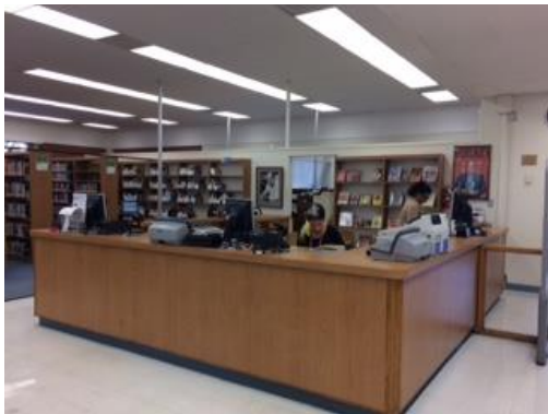
Customer Service Desk

Space Use. The dual entrances create an inefficient use of space requiring an excessive circulation allowance 15 . The customer service desk is oversized and the reference desk, which is also large, is located close to the customer service desk. As noted above, the facility is 6,496 square feet. If the rest rooms were upgraded and the contents of the current facility were removed and then returned with adequate clearance to meet current disabled access, building and fire and life safety codes, the space required would be at least 7,500 square feet. Meeting accessibility requirements would trigger a net loss of approximately 8,000 volumes (17%) and 11 reader seats (22%) or their equivalent. To illustrate this point, Appendix D contains the floor plan for the recently remodeled Lomita Library. With similar contents, the Lomita Library requires 8,000 square feet of space 16 .