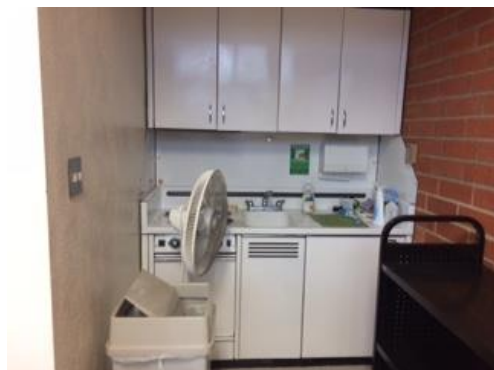
Staff Kitchenette and Storage Area

inaccessible. The exterior doors are not power assisted. Clearances at doors and set backs of security gates do not meet current codes.