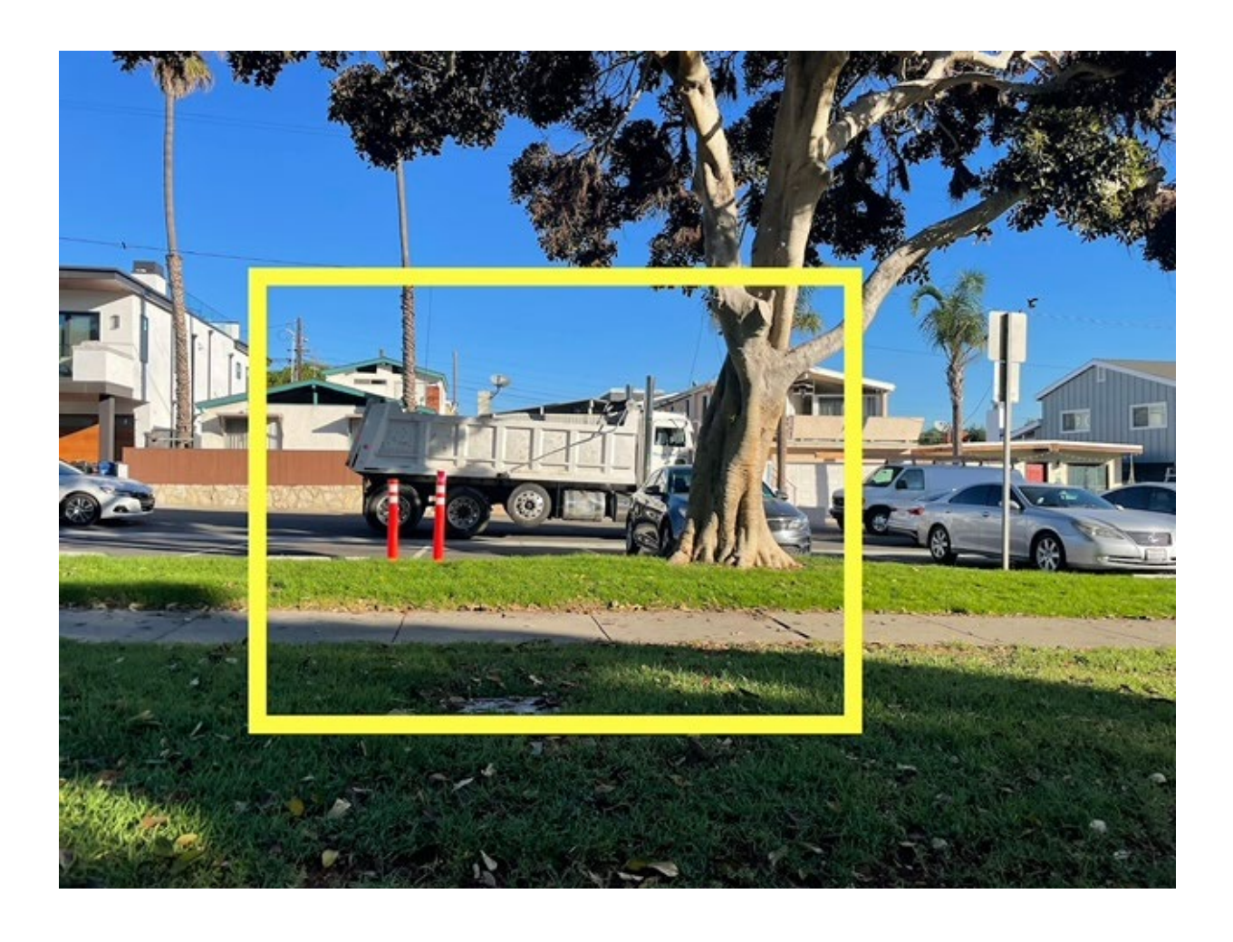
Above is a truck stuck in the backup

There were backups on 27th from Valley Drive to Manhattan Ave that lasted about 30 minutes.